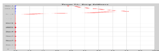
Graph 3: Stirey stiffness of the communication tower in wind y direction